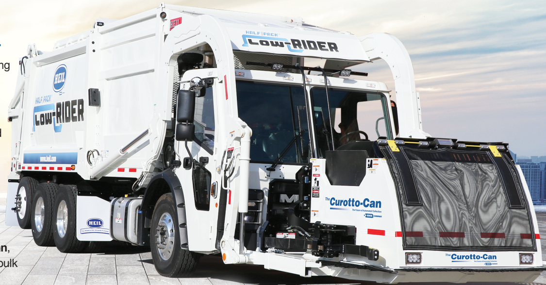
Shown with optional Half/Pack® LowRider™ Body and Curotto-Can® Residential Package

* Heil does not provide tax advice. Please consult your tax advisor regarding the specific tax implications of your selected product.