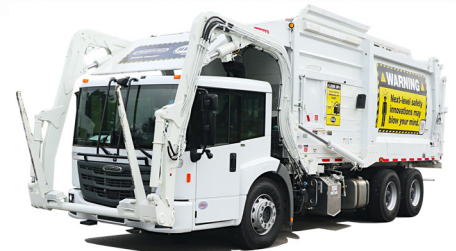
Available with articulating arms for EconicSD chassis