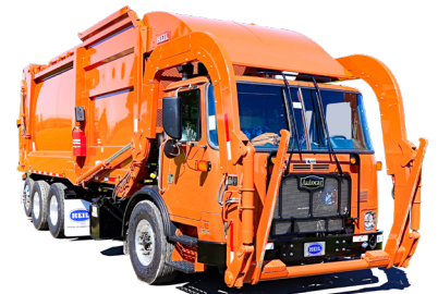
Available in lightweight Freedom body package