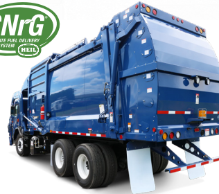
Available with optional CNRG® Tailgate