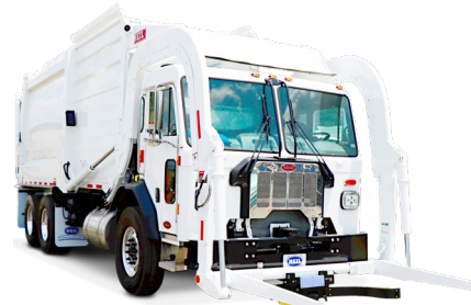
Available with Curotto® commercial grabbers