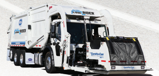
Optional Curotto-Can® Residential Package