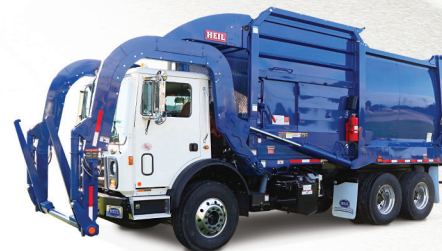
Available in 20 yard body configuration