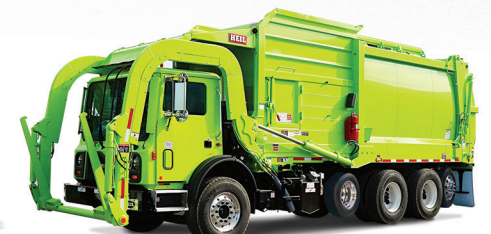
Available with 5-axle configuration