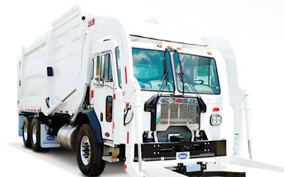
Available with commercial grabbers