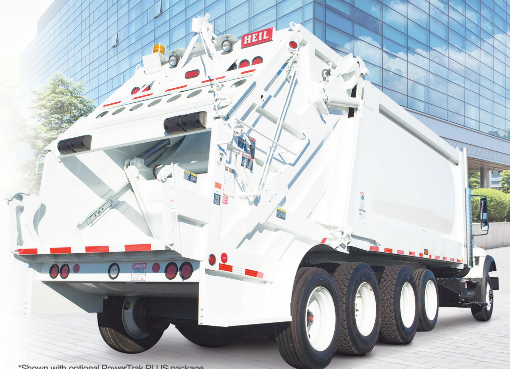
*Shown with optional PowerTrak PLUS package