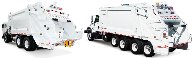
Heil PowerTrak Commercial

The PowerTrak Commercial was specifically designed to maximize your efficiency on daily collection routes.