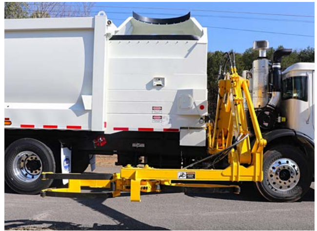
The Parts Central Fen-X Remanufactured Python arm replacement program provides unbeatable value and reliability.