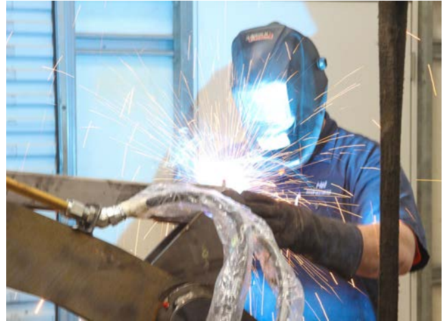
Weldments, cylinders, and valves are reconstructed and tested by Heil® certified technicians to ensure that OEM specs are met.