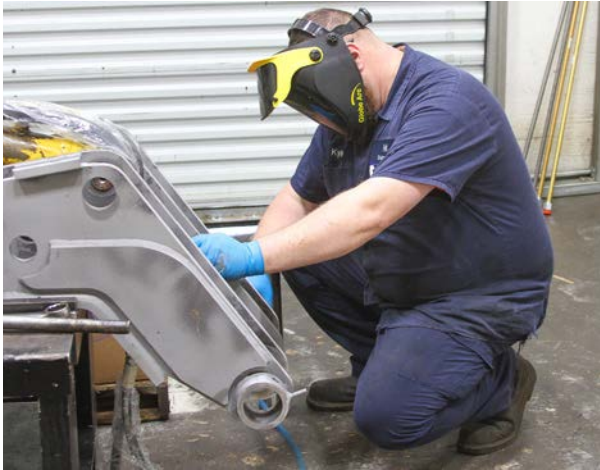
Arms are completely disassembled and thoroughly sandblasted to bare metal prior to inspection.

The most cost-effective program to provide affordable, reliable Genuine Heil OEM parts for your refuse equipment. Don't cut quality, cut costs!