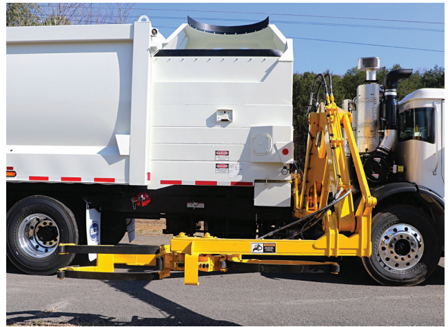
The Parts Central Fen-X Remanufactured Python arm replacement program provides unbeatable value and reliability.