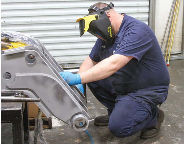
Arms are completely disassembled and thoroughly sandblasted to bare metal prior to inspection.

The most cost-effective program to provide affordable, reliable Genuine Heil OEM parts for your refuse equipment. Don't cut quality, cut costs!