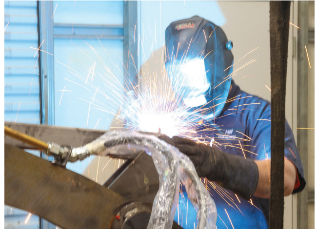
Weldments, cylinders, and valves are reconstructed and tested by Heil® certified technicians to ensure that OEM specs are met.