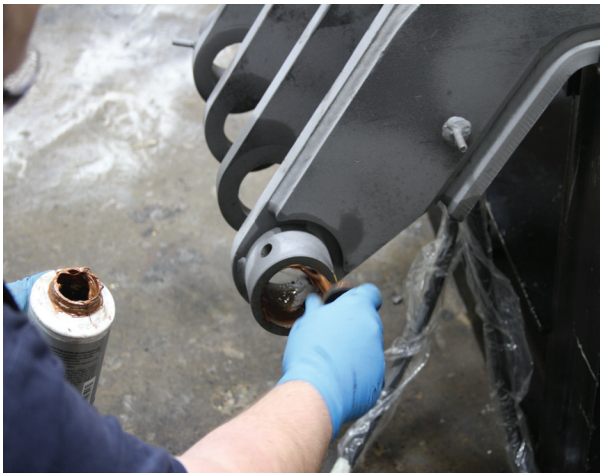
All wear items including pins, bushings, and seals are replaced with genuine Heil OEM parts.